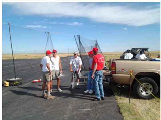
2012 CONTEST PICTURES